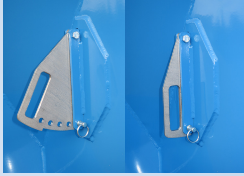
Adjustable Hay Stop restricts the flow of long forages for faster cutting.