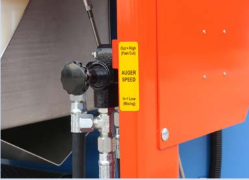
Push/Pull Selector Valve allows easy change between high & low auger speed.