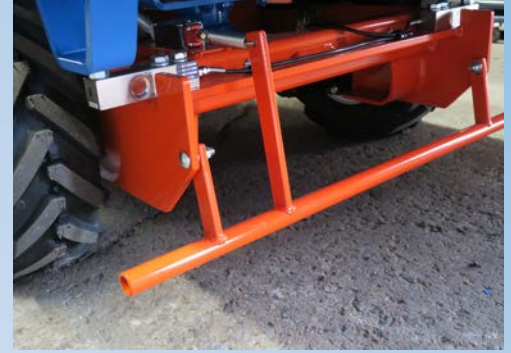
Safety Shutoff Bumper helps prevent serious injury.