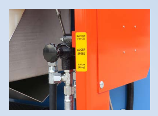
Push/Pull Selector Valve allows easy change between high & low auger speed.