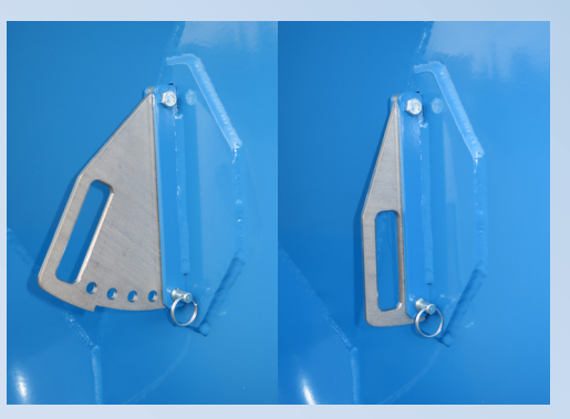
Adjustable Hay Stop restricts the flow of long forages for faster cutting.