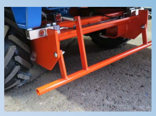
Safety Shutoff Bumper helps prevent serious injury.